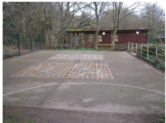
View of the top playground as it is now from each end.