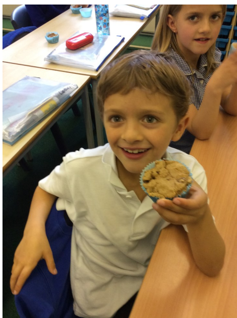
War time cooking