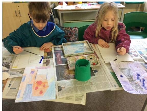
The artists in Owls class hard at work