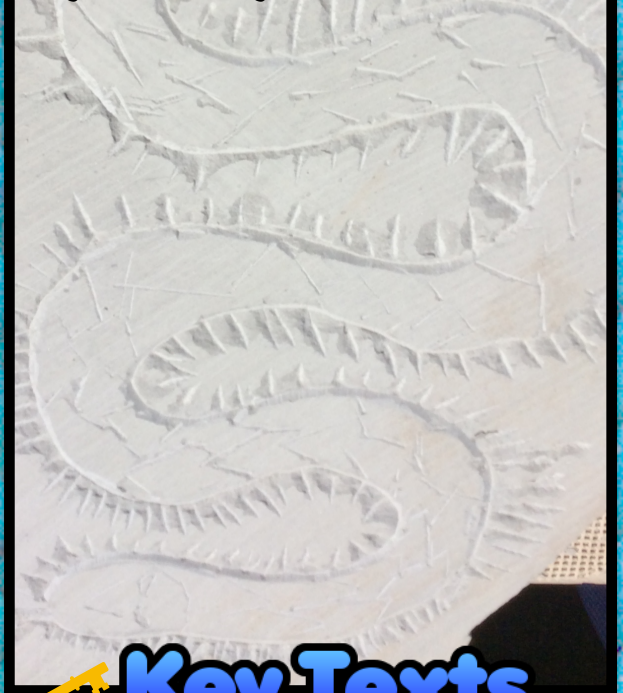
Dragon stone-carving at Stedham